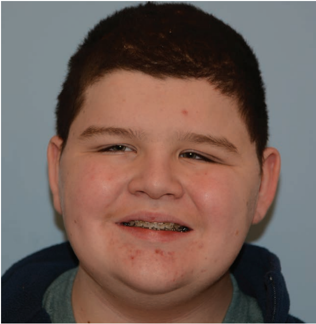
Fig. 3. Clinical photograph 1 month post frontal cranioplasty demonstrating favorable aesthetic result.

the strong association between greater sphenoid wing dysplasia and NF1 in the literature, and advocate for continued surveillance for patients presenting with similar clinical scenarios.