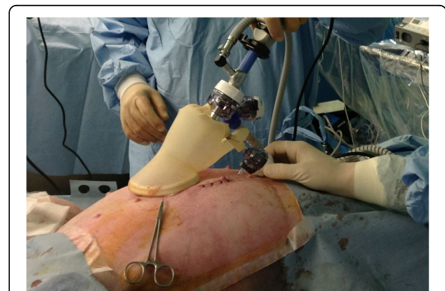
Fig. 1 External view of Laparoendoscopic single site surgery homemade single-port device using a surgical glove, wound retractor (Alexis, Applied Medical), and trocars

Two assessors with experience in laparoscopic surgery and LESS scored the cystorrhaphy performances. The OSATS evaluation was used to assess the videos for quantity (time to close the cystostomy, number of knots required, and each step of procedure) and quality (see Appendix). These methods were adopted and edited from Martin et al. [9]. We used the same OSATS that McDougall et al. [10] used to score porcine laparoscopic cystorrhaphy. The participants were assessed on task success, and on whether the closure was watertight or not. The closure's watertight seal was assessed at the end of the procedure by instilling 150 cm 3 of saline into the bladder under laparoscopic visualization. A successful