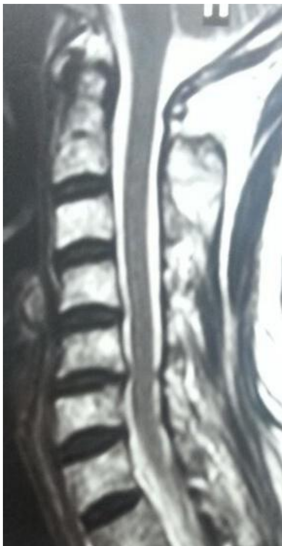
Figure 1: Magnetic Resonance Imaging T2 sequence of cervical spine, showed compression of spinal cord at C 5-6 level

Nucleus pulposus of the disc would come out through the wall of the disc, filled the spinal canal and compress the spinal cord (Fig. 1).