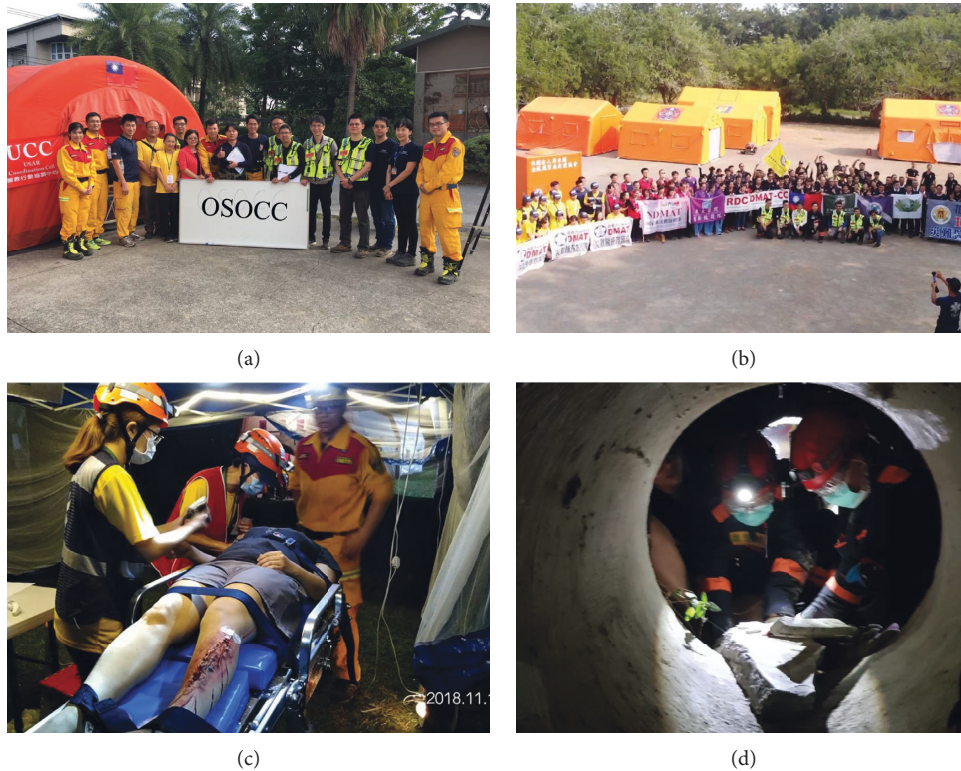
FIGURE 3: Photographs of the full-scale exercise. (a) Group photo of the core leader of each unit after the meeting at OSOCC; (b) group photo of DMATs in the base of operation; (c) part of the medical station in Scene B; (d) DMAT doctors performing emergency amputation surgery in a confined space.

of local anesthesia, the lack of laboratory test tools, cold chain equipment for tetanus toxoid storage, and sterilization devices. We believe these problems can be overcome in subsequent preparations, since the lack of compliance was due mainly to a lack of funds and not to insufficient training. On the other hand, two DMATs brought portable ultrasound devices to the disaster field, and they used them to scan patients with suspected tension pneumothorax, internal bleeding, pericardial effusion, and long bone fractures and to evaluate patients' hemodynamic status, which was very helpful in the disaster scenario. Shorter and Macias [20] reported the use of portable ultrasound devices after the Haiti earthquake, which influenced decisions on patient care in 70% of scans. Wydo et al. [21] also observed that the use of ultrasound can help in the rapid evaluation, triage, and treatment of injured patients in disasters. Based on previous studies and the experience of this exercise, ultrasound is strongly recommended for use in mass casualty incidents and disaster triage, even though it is not the standard equipment in the self-assessment minimum technical standards for type I EMTs.