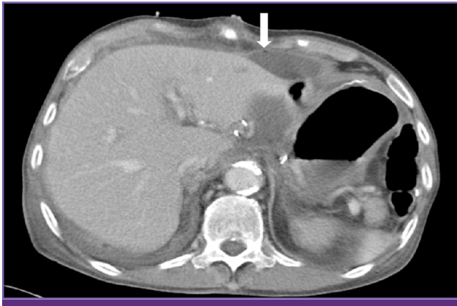
Figure 1. CT on abdomen showed complicated fluid collection with a small amount of air bubble (arrow) around the operation site.

rate, 25 breaths per minute. Generalized abdominal tenderness was observed, without rebound tenderness. Blood tests showed a leukocyte count of 42,770/\text{mm}^3 with segmented neutrophils of 90.2% and a high sensitivity C-reactive protein level of 21.22 mg/dL. His blood, urine culture result showed no growth of bacteria. Findings on abdominal computed tomography showed complicated fluid collection with a small amount of air bubble around the operation site (Fig. 1). Percutaneous catheter drainage was inserted into the peritoneal cavity. Doripenem (500 mg every 8 h) was started empirically.