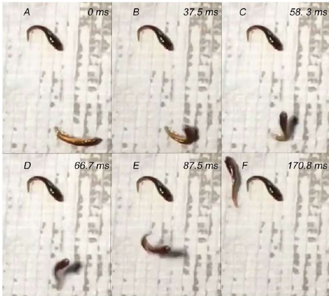
Fig. 4 Juvenile northern snakehead tail-flip jump. (A) A juvenile northern snakehead (bottom right of the panel, \sim 3.2 cm in TL) begins a tail-flip by lying on its lateral surface, and then (B) lifts its head above the substrate and bends it towards the tail, making a C-shape with the body. (C) Once the fish is maximally bent, it rapidly pushes against the substrate with its caudal peduncle, (D) launching itself into a ballistic flight path. (E) While the fish is airborne, it can travel several body lengths before landing (F) next to a stationary northern snakehead.

therefore, the tilted boat deck data were included in neither the ANOVAs nor correlation tests for velocity and relative velocity. While most individuals moved downslope on the tilted boat deck, one individual moved upslope, but was not included in the statistical analysis. Electrode implantation had no significant effects on any kinematic or performance parameters for individuals moving on turf (Table 3), so data from individuals with electrodes implanted were combined with the rest of the turf data for comparisons to other substrates. Overall, small northern snakeheads moved differently than large ones. As length increased, absolute velocity and CC significantly increased, while relative velocity and head and COM WA significantly decreased (Tables 2 and 3; Fig. 3).