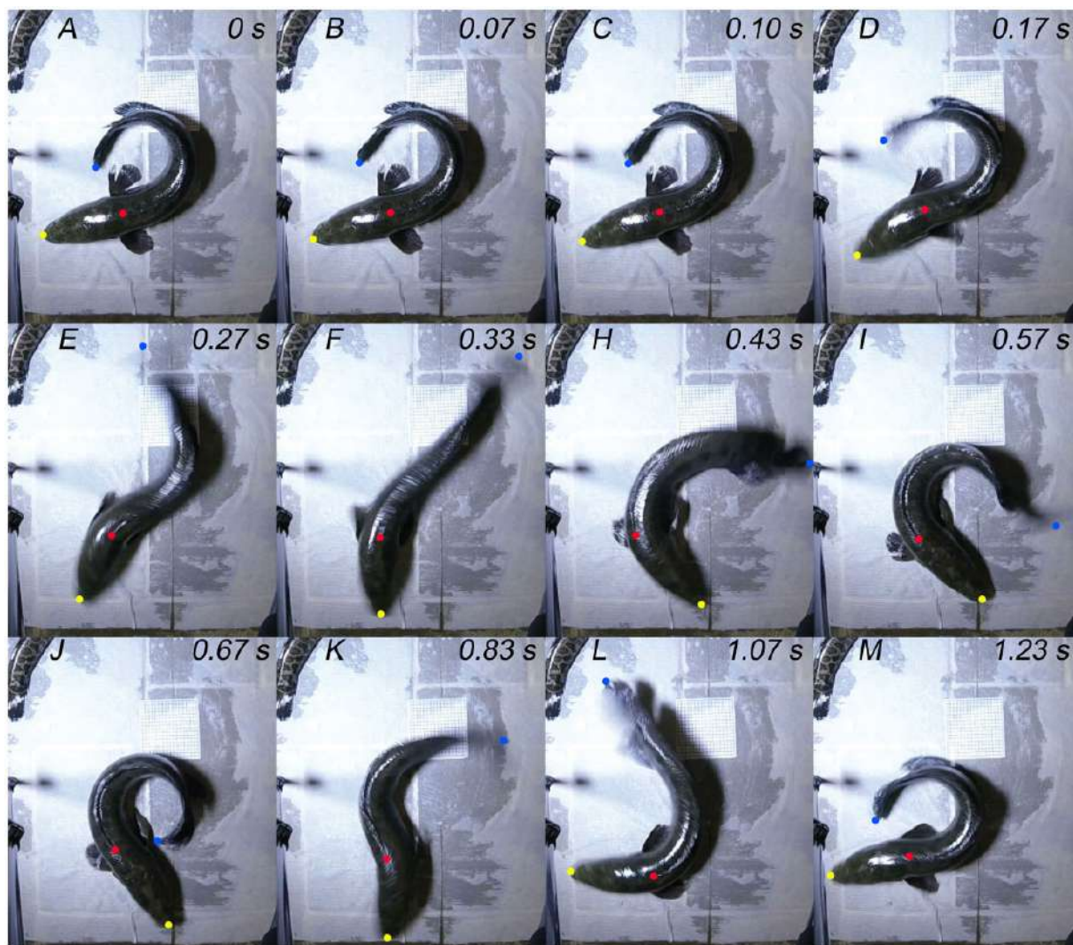
Fig. 2 Northern snakehead forward crawl behavior. (A) A northern snakehead begins crawling by (B) moving its head toward the left and swinging the tip of its tail laterally toward the right. (C) The head and tail continue to move as the left pectoral fin begins retracting. (D) The right pectoral fin begins to retract, and the tail tip has achieved its approximate maximum lateral amplitude as it begins swinging toward the body's midline. (E) Both pectoral fins are fully retracted as the head crosses the midline of the body. The fish rolls along its longitudinal axis partially onto its left pectoral fin, while the posterior axial body appears to push against the substrate. (F) The pectoral fins begin to protract as the tail crosses the body's midline. (H) The fish rolls along its longitudinal axis toward the right side of its body as the tail tip rapidly increases in amplitude toward the left. (I) Both pectoral fins are fully protracted and the head has reached its maximum amplitude on the left side of the body. (J) The head begins moving back toward the right as the tail tip has reached its maximum amplitude on the left. The pectoral fins begin to retract. (K) The head and tail are both moving toward the right side of the body as both pectoral fins are fully retracted. The fish rolls partially onto its right pectoral fin, as the posterior axial body appears to push against the substrate. (L) The head has approximately reached its maximum amplitude as the fish rolls toward the left side of its body and rapidly increases the tail tip amplitude on the right side of the body. (M) The tail tip has reached its maximum amplitude on the right side of the body and the head begins moving back toward the left side of the body, starting a new stride. The three points tracked—tip of the snout, anterior insertion of the dorsal fin/COM, tip of the tail—are shown by yellow, red, and blue dots, respectively.

push against the substrate to provide forward thrust. In addition to potentially providing thrust, the pectoral fins help support the fish, likely keeping them upright and preventing excessive rolling. The larger fish that were filmed laterally (>30 cm) did not lift their ventral surface above the substrate (Supplementary Video S3).