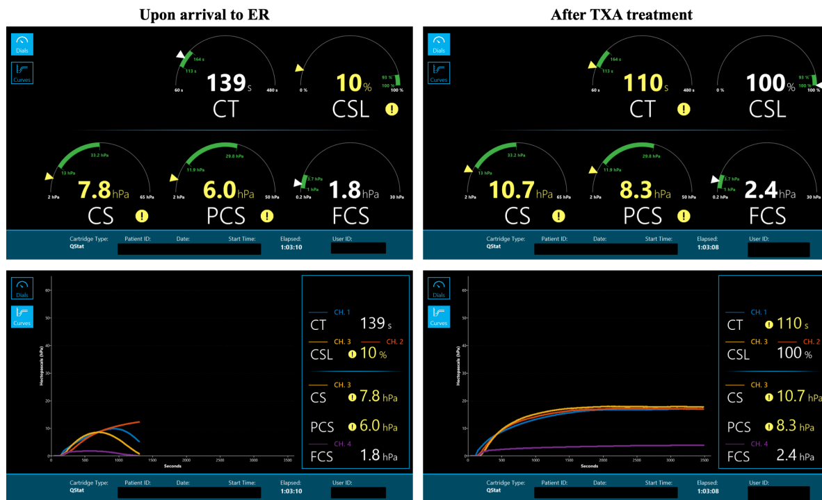
Figure 1 Quantra QStat dials and curves generated on arrival to the emergency room (ER) (left panels) and after the administration of antifibrinolytics (right panels). For each dial, the green bar represents the normal reference range. Values outside the reference range are flagged with a different color and a warning sign. As expected, after the administration of antifibrinolytics, the QStat CSL parameter returns within the normal range from an initial value of 10% indicating significant clot dissolution (as also confirmed from the corresponding curves). CSL, Clot Stability to Lysis; TXA, tranexamic acid.

QPlus parameters, the bias does not introduce concerns regarding the comparison of these devices since measured results are interpreted in relation to the respective reference intervals. 22