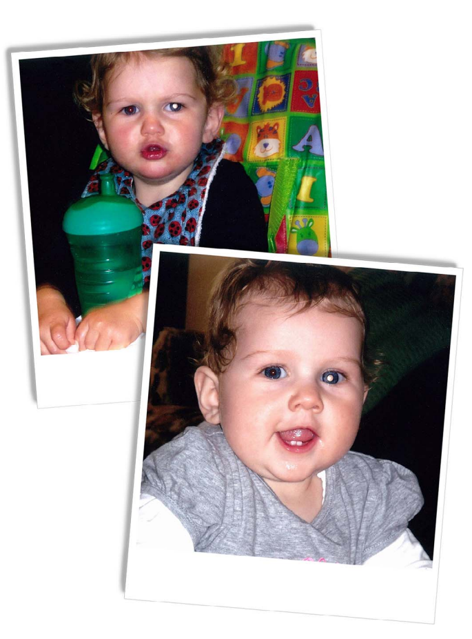
Figure 1. Images used in the online survey. Participants were informed that they had taken these photographs of a family member on separate occasions and then were asked to search the Internet for information about their observations.

book users over the age of 18 years and no financial or other rewards were offered to encourage participation. Information about the study was provided, with consent implied when the participant elected to complete the online survey. Basic demographic data were collected including: age, sex, geographic location, parental status, and healthcare background.