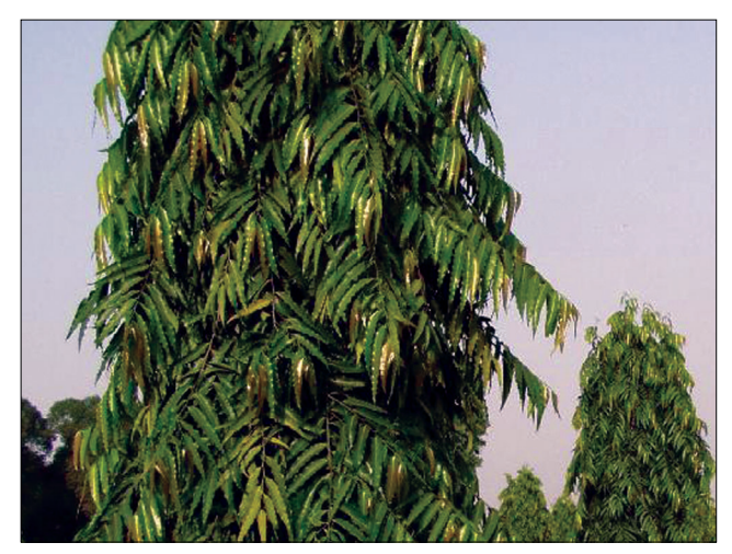
Figure 3: The whole tree of P. longifolia