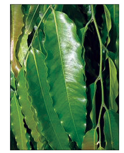
Figure 1: Leaves of P. longifolia

The plant grows throughout the tropical and subtropical parts of India up to an altitude of 1500 m. A tall, evergreen, handsome, pyramid-like, columnar, tree: main stem straight, undivided, growing up to 12 m or more. Branches slender, short, about 1-2 m long, glabrous, and pendulous. Leaves alternate, exstipulate, distichous, mildly aromatic, 7.5-23 by 1.5-3.8 cm, shining, glabrous, narrowly lanceolate, tapering to a fine acuminate apex, margin markedly undulate, pinnately veined, leathery or subcoriaceous, shortly petiolate; petiole about 6 mm long. Flowers arise from branches below the leaves, nonfragrant, 2.5-3.5 cm across, yellowish to green, in fascicles or shortly pendunculate umbels; petals 6, 2 seriate, flat, from a broad base, lanceolate, long accumulate, spreading; and sepals 3, broad, short, triangular, the tips reflexed. Stamens many, cuneate; connective truncately dilated beyond the cells. Ovaries indefinite; ovules 1-2; style oblong. Ripe fruits ovoid, 1.8-2 cm long, numerous, stalked, glabrous, 1 seeded; stalk 1.3 cm long, short, glabrous. Seeds smooth, shining. Flowering and fruiting: February-June.<sup>[25,26]</sup>