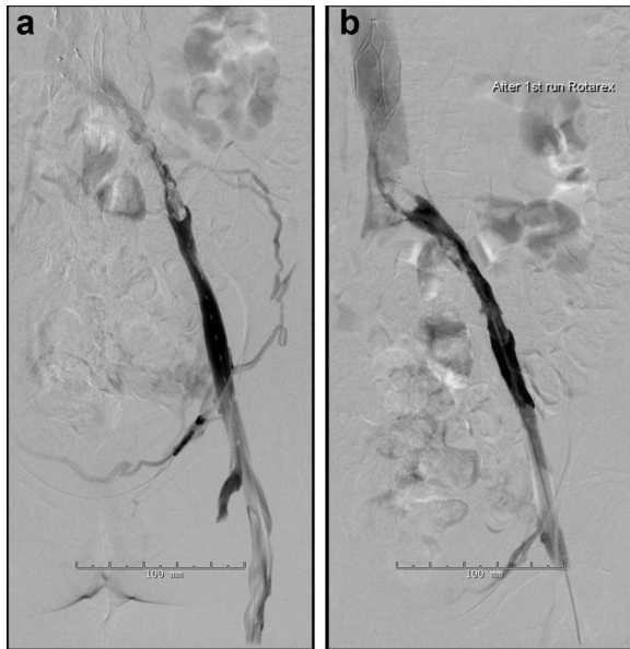
Fig 2. Digital subtraction phlebography showing the results after 48 hours of ultrasound-accelerated catheter-directed thrombolysis (UACDT, a ) and after mechanical debulking with the Rotarex catheter ( b ).

restenosis and occlusion, may increase in the following years. Stent primary patency rates for stented chronic venous lesions are reported to be in the range of 57% to 79% at 72 months. 5 Suggestions for treatment of in-stent restenosis and occlusion range from CDT with or without restenting to more technically advanced solutions, like percutaneous or open thrombectomy with or without restenting.