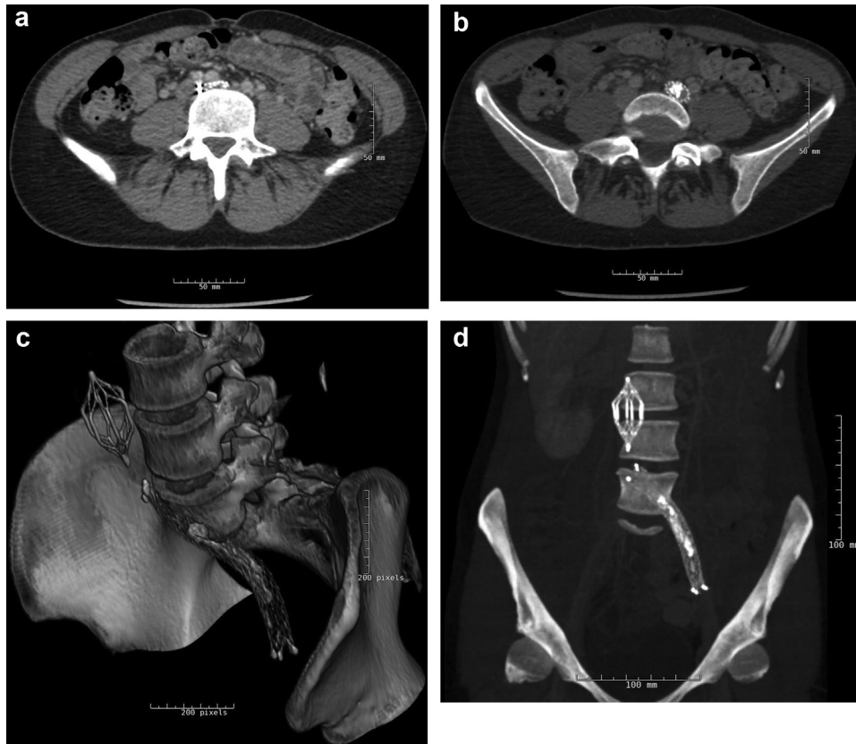
Fig 1. Computed tomography scans showing compression of the stent at the May-Thurner point (a) and high-density (calcified) material inside the stent distal to the compression (b). Three-dimensional reconstructions of these scans show the entire stent, including the compressed outflow and the calcified material within it as well as the vena cava filter (c and d).

strictly inside the stent with an 8F Rotarex catheter (Straub Medical AG, Wangs, Switzerland). The Rotarex catheter is an over-the-wire device, consisting of a catheter with a rotating head, spinning at 40,000 rpm, driven by an external motor. The rotating head detaches and fragments thrombus material from the vessel wall. An inner Archimedes screw inside the catheter, rotating at the same speed, creates a vacuum that aspirates the material and transports it out of the vessel. Although mechanical debulking of calcifications is not strict on-label use of the Rotarex catheter, it did remove some but far from all of the calcified material (visual estimate, 25%-50%; Fig 2).