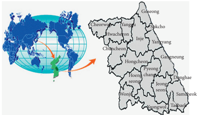
FIGURE 1: Map of Gangwon Province (accessed at http://www.provin.gangwon.kr/gw/portal ).

variables and the outcome are summarized using proportions for categorical variables and means and medians for continuous measures. Statistical comparisons of observed values between outcome groups were based on weighted \chi^2 and t -tests adjusted for survey characteristics. If a continuous parameter was normally distributed, we applied the t -test for independent samples. For nonnormally distributed data, we used the Mann–Whitney U test. Pearson's \chi^2 test or Fisher's exact test was used to compare categorical variables. Standardized plausibility checks were carried out under statistical supervision. For statistical analyses of the data, we used IBM SPSS version 20.