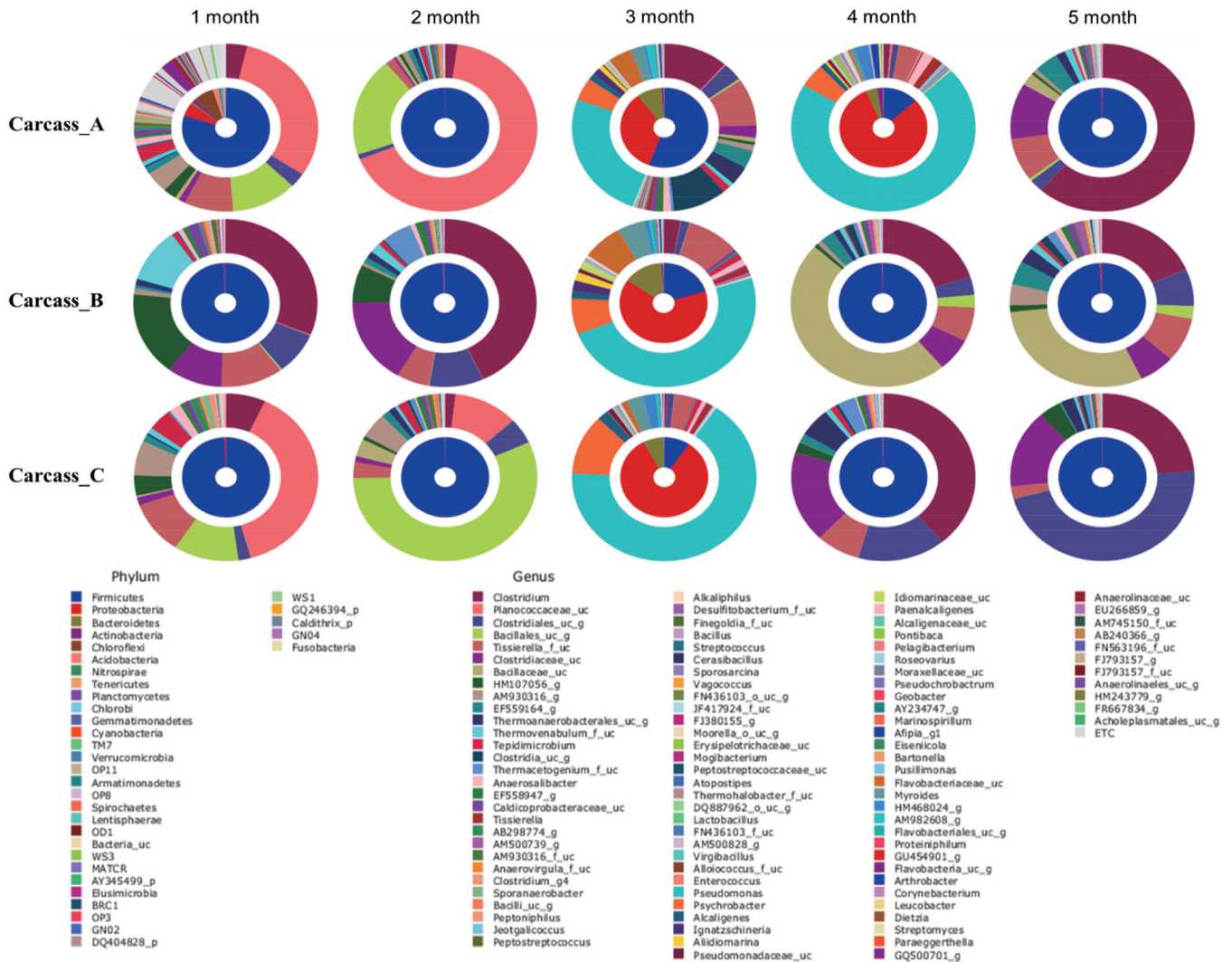
Figure 2. Double pie charts of bacterial communities. The inner and outer pies represent the composition of phyla and genera, respectively. The numbers above each pie indicates the sampling time. The nomenclature of phylotypes is based on the EzTaxon-e database (Kim et al [16]; https://www.ezbiocloud.net/ ).

genus level (Figure 2). The changes in bacterial phyla from carcasses B and C during decomposition were similar, whereas the bacterial genera in leachate samples from these carcasses differed. Clostridium , Clostridiales , and Tissierella were the dominant genera in the samples from carcass B at 1 and 2 months of decomposition. Tissierella is an anaerobic species that reduces proteins and amino acids, and the abundance of these bacteria generally increases with decomposition, whereas Clostridiales play a major role in degradation of protein and cellulose [20,24]. Previous reports have suggested that an anaerobic zone that develops around a carcass during composting is responsible for the increase in Clostridium .