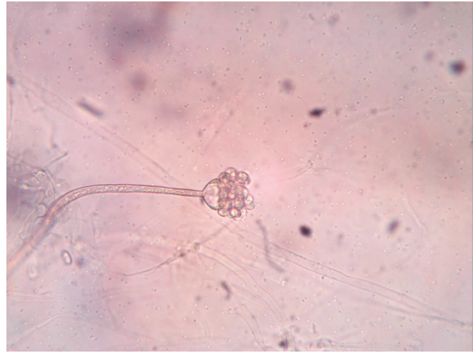
Fig. 2: Wet mount from water culture showing Apophysomyces variabilis