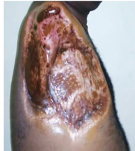
Fig. 4: After shoulder disarticulation and completion of 6 weeks of antifungal therapy

and clavicle were done. On the 12th postoperative day, necrotizing fasciitis was observed and empirical amphotericin B was started. Debrided wound tissue showed bacterial growth and no evidence of fungi. Despite higher antibiotics, there was no clinical improvement. Deep tissue debridement was done and mycological techniques showed evidence of Apophysomyces elegans (Fig. 2). On 14th postoperative day, patient developed cardiac arrest, revived, and was put under mechanical ventilation. On 15th postoperative day, shoulder disarticulation was done and all necrotizing tissues were removed (Fig. 3). Conventional amphotericin B was administered twice daily for 30 days. Patient was discharged in good condition after 100 days of admission (Fig. 4).