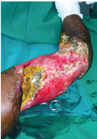
Fig. 3: Black necrotic tissue before starting antifungal therapy