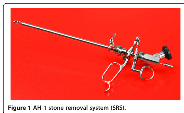
Figure 1 AH-1 stone removal system (SRS).