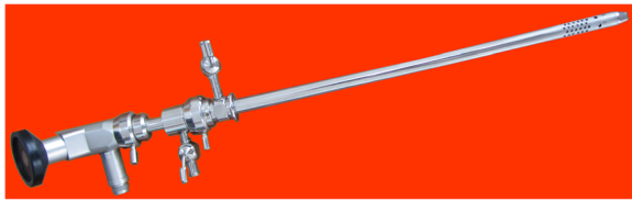
Figure 2 The outer sheath with inner sheath and endoscope.