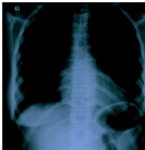
Figure 1. Straight left upper border of heart

At the time of present admission, her vital signs were normal. The patient was aphasic. In her heart auscultation, late systolic murmur was heard in apical region. Other physical examinations did not reveal any positive findings. All laboratory data were in normal ranges. In her requested chest X-ray (CXR), cardio-thoracic ratio (CTR) was normal, but the left upper border of the heart was straight (Figure 1).