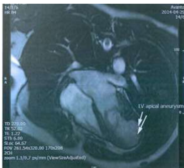
Figure 3. Left ventricular (LV) apical aneurysm

The patient was discharged with warfarin and in acceptable general condition. Her routine follow ups after surgery were normal and did not show any abnormalities.