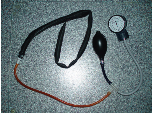
FIGURE 1: Artificial necktie apparatus.

commencing. All subjects gave informed consent and were allowed to withdraw from the study at any time. As this was a pilot study and as we were interested in novel risk factors, we invited healthy men with no known history of vascular disease and on no regular medication to participate.