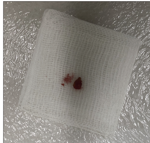
Figure 4: The extracted sunflower seed after the perianal abscess drainage