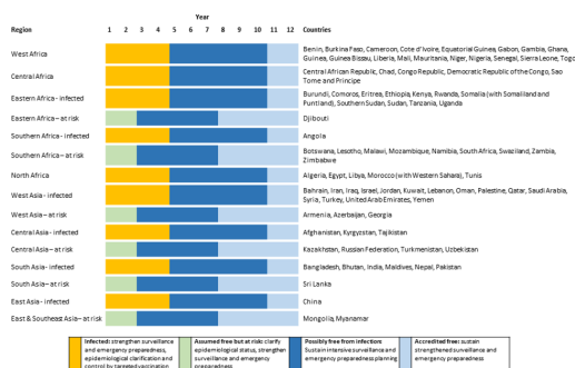
Fig 3. Initial disease status of countries and expected progress of eradication.

Phase I Preparation. The objective of this phase would be to develop and launch effective PPR eradication programmes at the international, regional and national levels. During this 3-year phase the focus would be on establishing coordination mechanisms at global, regional and national levels, training personnel in essential skills, undertaking the required research, collecting and analysing data on small ruminant populations and PPR epidemiology, developing national and regional plans or refining existing control programmes, strengthening surveillance systems and vaccination capacity, and commencing control activities in key populations. Establishing effective surveillance systems, supported by laboratory diagnostics, that use an