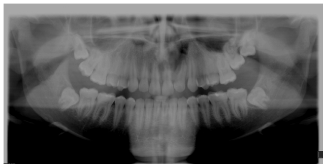
Fig. 3 – Panoramic x-ray: abnormal root shape (tooth 22). (The tooth has 2 roots.)

(41.9%) subjects in the study group and 1 (3%) in the control group. Bone structure abnormalities (localised changes of bone density) were observed in 8 (25.8%) patients in the study group, whilst the control group did not have any such disorders ( P = .002 ).