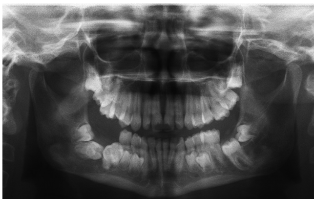
Fig. 2 – Panoramic x-ray: impacted teeth (37, 46, and 47). In the picture, there are also persistent deciduous teeth (74, 84, 75, and 85) and visible talon cusps of 13-23.

Disorders regarding dental pulp mineralisation (pulp stones) occurred in 20 patients (31.3%), 17 of whom were in the study group and 3 of whom were in the control group ( P < .001 ). More than one abnormality of this type involved 13