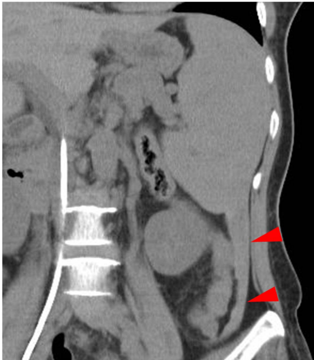
Figure 1. A 55-year-old woman with anemia underwent splenic biopsy. Immediately after biopsy, no obvious hematoma was observed around the spleen; however, mild hematoma formation was seen in the paracolic gutter (arrowheads). doi:10.1371/journal.pone.0111657.g001

Therefore, splenectomy may not be suitable for patients with malignant lymphoma.