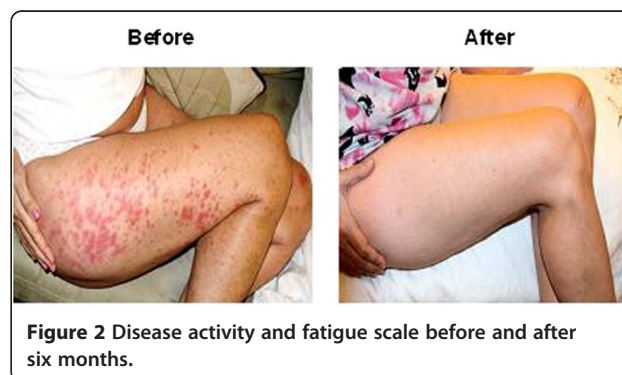
Figure 2 Disease activity and fatigue scale before and after six months.

To our knowledge this is the first report in a full paper describing the short term efficacy and safety data in patients with SLE receiving belimumab and standard therapy in real life from a individual center. It was possible to observe that our results are similar to those described in clinical trials with long term evaluations, such as the seven years recently reported recently reported by Ginzler and co workers where it was possible to observe a sustained reduction of disease activity , improvement in serology and daily reduction on steroid use (Ginzler et al. 2014). In this initial report we were