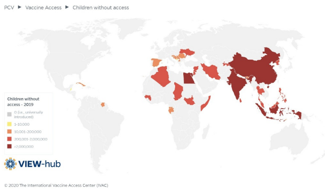
Figure 1. World map overview of the number ranges and locations of children without access to pneumococcal conjugate vaccines in 2019.

learnings from a previous partnership with WHO and African countries that developed and introduced MenAfriVac ® – a low-priced Neisseria meningitidis serogroup A conjugate vaccine that eliminated meningitis A epidemics in Africa’s meningitis belt. 11