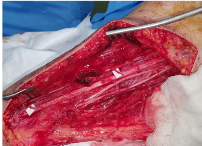
Fig. 1: First surgery in supine position.

Surgery scene as demonstrated by white backgrounds nerve fascicles transferred from the ulnar nerve to the biceps brachii of the musculocutaneous nerve and from the median nerve to the brachialis branch of the musculocutaneous nerve.