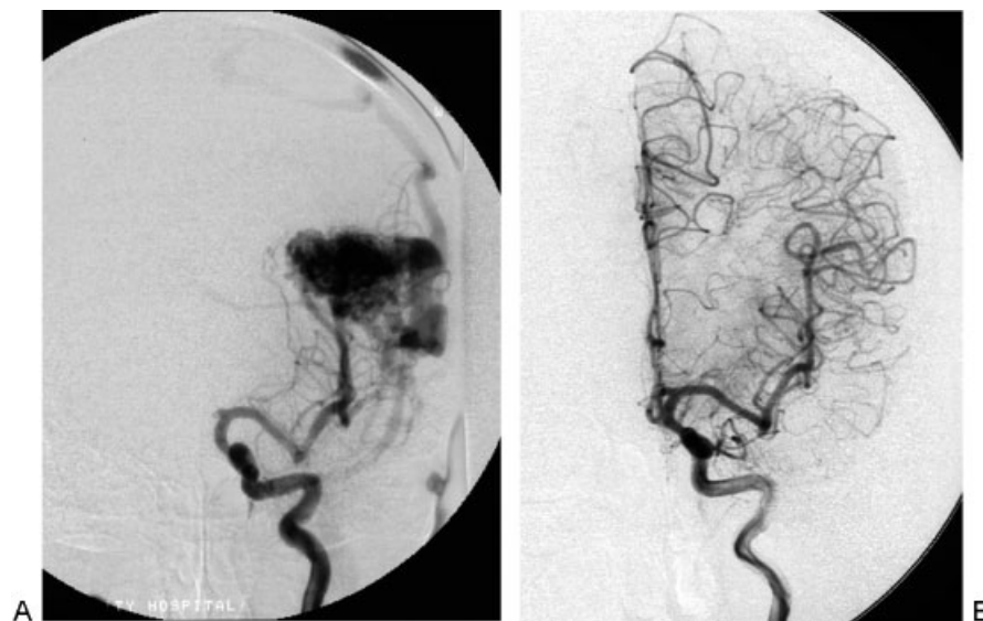
Fig. 2 (A) The anteroposterior image of the left internal carotid angiogram prior to the first radiosurgery showed an arteriovenous malformation fed by the middle cerebral artery and drained into the superior sagittal sinus. (B) The left internal carotid angiogram 3 years after the second radiosurgery showed complete eradication of the shunt flow.

Stereotactic radiosurgery is purported to be a less invasive procedure for vascular malformations and central nervous