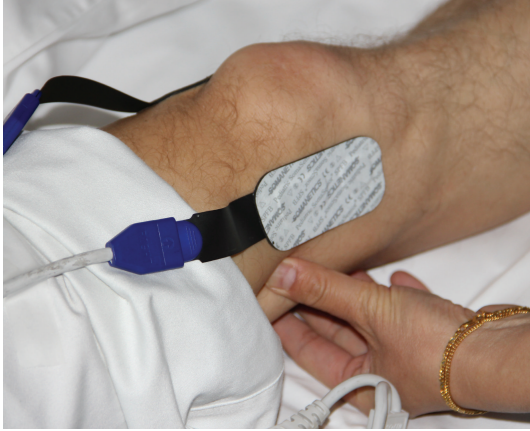
FIGURE 1: Measurement site with applied sensors during acupressure stimulation.