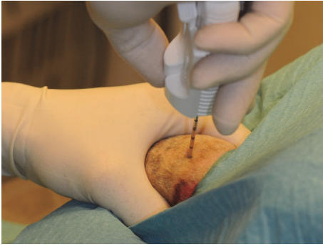
FIGURE 1: After razing and disinfection with chlorhexidine digluconate 0.5% in ethanol 96% and staining with curcumin, TESE was performed using a 14-gauge TruCut needle, which was introduced percutaneously through the scrotal skin and into the ram testis.

after TESA using a 19-gauge butterfly needle. However, 9 months later, it was not possible to refind the lesions [17]. In a minor study where most participants were diagnosed with OA, none showed abnormalities by testicular ultrasonography 3 months after TESE using a 14-gauge TruCut needle [18].