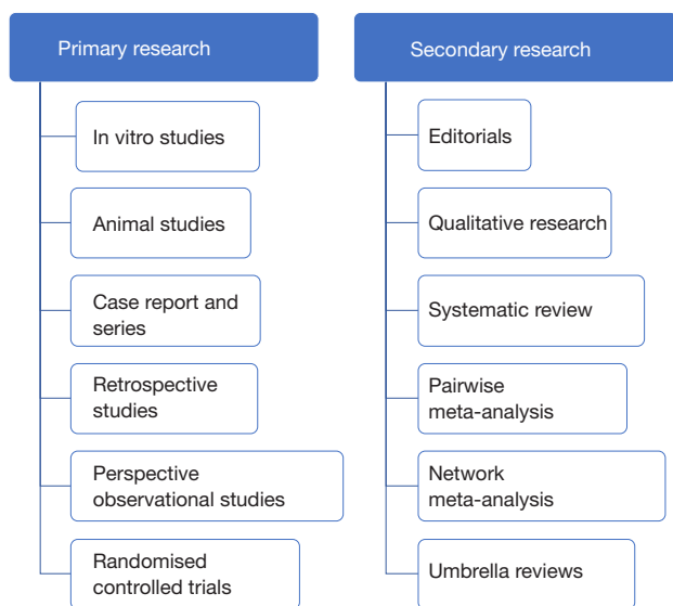
Figure 1 Evidence hierarchy of primary and secondary research.