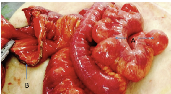
Fig. 2. Picture of the operative field showing, (A) multiple cysts of the small bowel, (B) area of bowel resection.