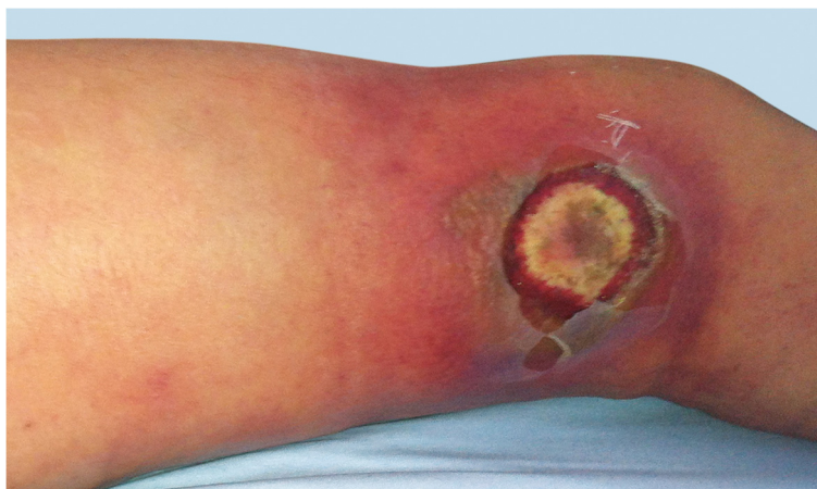
Figure 1 Skin manifestation after bagatelle injury on day 11 after admission.

If surviving this medical and surgical emergency, patients face long hospitalizations on intensive care units, multiple reconstructive interventions and intensive rehabilitation. Mortality rates have been shown to be determined by the time and delay of operative intervention [6-9]. Therefore, timing and adequacy of radical, extended operative debridement coupled with supportive broad-spectrum antibiotics has a substantial influence on the remaining high mortality [10,11]. To assure patient safety not only in surgery - a high index of suspicion leading to the expeditious diagnosis of necrotizing fasciitis followed by appropriate resuscitation and eradication surgery is needed. The diagnosis and distinction of NF from other less fatal soft tissue infections is still notoriously difficult and becomes even more challenging if patients' clinical presentation is exceptional due to an underlying disease and its specific therapy.