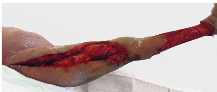
Figure 2 Intraoperative appearance after initial radical debridement on day 11 after admission.

Although there have been several attempts to identify special criteria for early diagnosis, necrotizing fasciitis is a clinical diagnosis depending on verifying operative findings. As the infection takes its origin in the deep tissue, delayed diagnosis followed by subsequent delayed