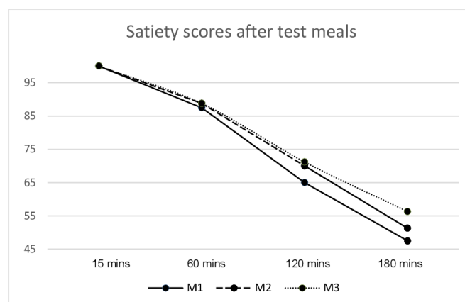
Figure 2 Satiety scores after test meals.

Rice is the staple food in Sri Lanka. Furthermore, coconut ‘milk’ and coconut oil are also used very commonly to prepare food. There is unpublished evidence to suggest that the addition of coconut oil during cooking and cooling of rice increases its RS content by as much as 10 times. 20 During this process, amylose lipid complexes are formed which undergo crystallisation during cooling. Cooling and subsequent reheating further increases RS content. 21 It is also