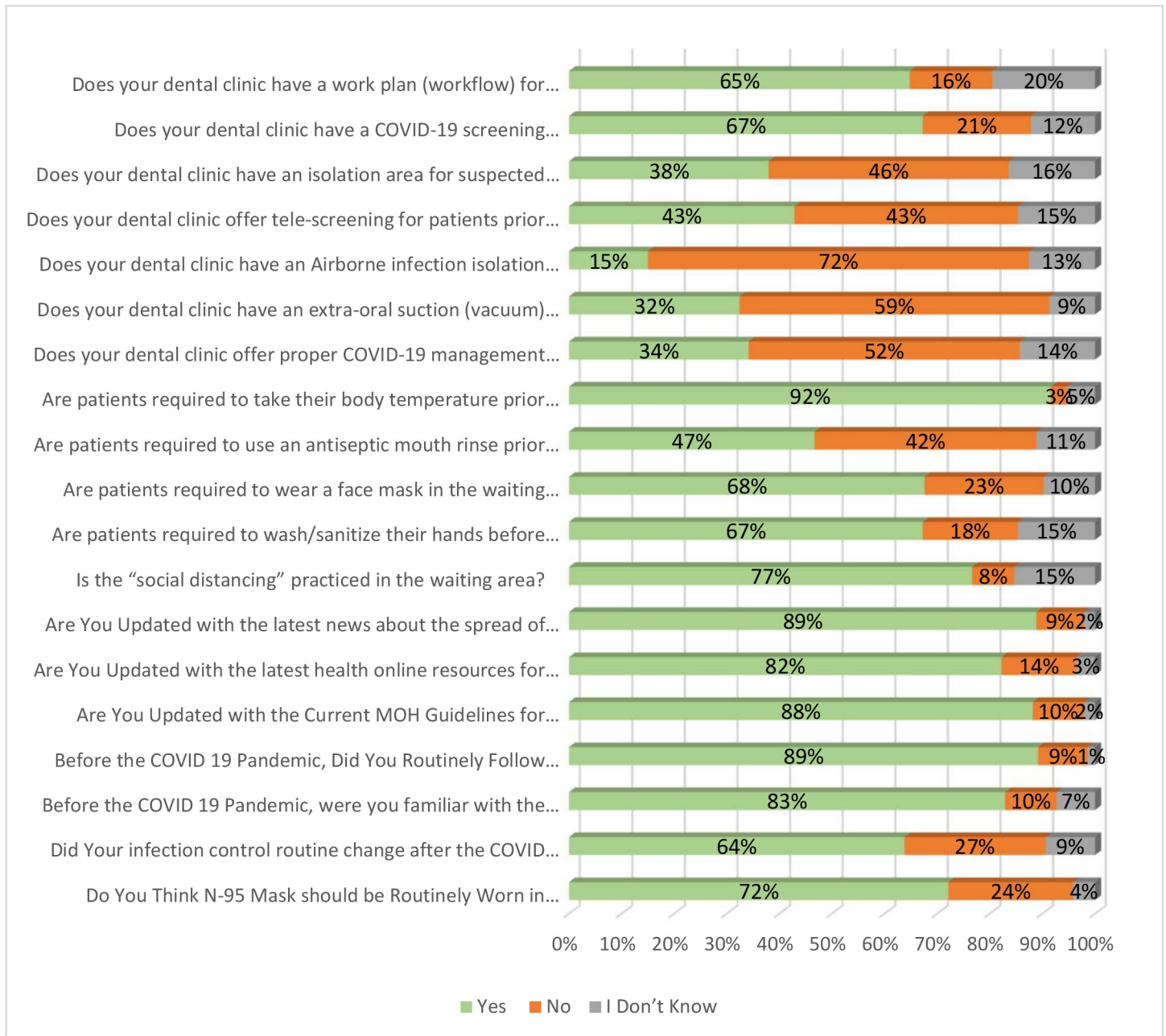
Fig 1. Responses of dentists' preparedness and perception of infection control measures against the COVID-19 pandemic.

https://doi.org/10.1371/journal.pone.0237630.g001