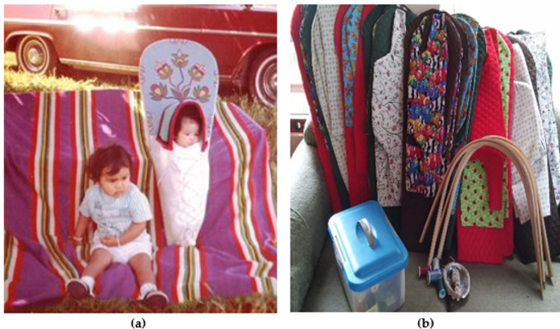
Figure 1. Cradleboards are a form of traditional engineering for carrying protecting babies (a) panel a includes the fifth author at one year of age next to her sister in a traditional Nez Perce cradleboard; (b) panel b showcases NAWDIM contemporary cradleboard class materials.

Traditionally, cradleboards were made with natural local materials such as deer hide and elegantly beaded or decorated, often with family or clan imagery and designs. Contemporary cradleboards are adorned with fabric and colors that may carry significance or meaning to families (see Figure 1). For example, the fifth author was especially close to her grandmother and chose fabrics with roses or violets, representing a shared love of these flowers and their strong intergenerational bond.