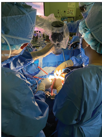
Figure 1: The whole operative view for the hematoma evacuation using ORBEYE. The operator (the trainee, right side) and the assistant (the supervisor, left side) bend their elbow joints moderately, facing the monitor, and they can perform a stable operation in a comfortable posture. The assistant (the supervisor) helps retract the brain using brain retractors and sets the visual axis of ORBEYE and adjusts focus and magnification as a scopist

ICH - Intracerebral hemorrhage; mRS - Modified Rankin Scale; IQR - Interquartile range; SD - Standard deviation