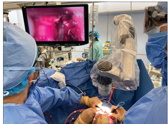
Figure 2: The whole operative view of 4-hands surgery for the hematoma evacuation using ORBEYE. The operator (the trainee, right side) and the assistant (the supervisor, left side) bend their elbow joints moderately, facing the monitor, and they can perform a stable operation in a comfortable posture. The operator (the trainee) evacuated the hematoma with a suction tube and coagulated using bipolar forceps. The assistant (the supervisor) helps retract the brain using brain retractors and withdraw and irrigate the hematoma using suction tubes or brain retractors