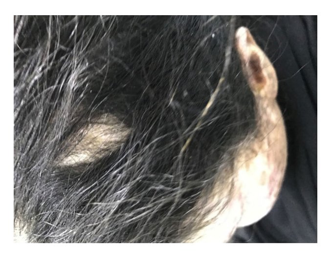
Figure 4 Discoid-like patch over the scalp.

For the histopathological examination, biopsies were taken from both hypo- and hyperpigmented lesions (Figures 5 and 6). Hyperpigmented lesions showed an abundance of melanin pigment in keratinocytes and melanocytes with the presence of a few scattered melanophages in hyperpigmented macules. In contrast, hypopigmented lesions showed a reduction in melanin and number of melanocytes as determined by Melan A