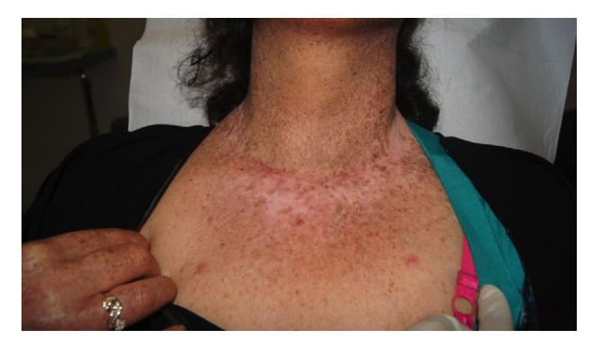
Figure 2 Reticulate hyperpigmented and hypopigmented macules on neck and upper chest.