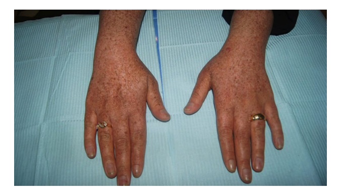
Figure 3 Reticulate hyperpigmented and hypopigmented macules on dorsa of hands.

For the histopathological examination, biopsies were taken from both hypo- and hyperpigmented lesions (Figures 5 and 6). Hyperpigmented lesions showed an abundance of melanin pigment in keratinocytes and melanocytes with the presence of a few scattered melanophages in hyperpigmented macules. In contrast, hypopigmented lesions showed a reduction in melanin and number of melanocytes as determined by Melan A