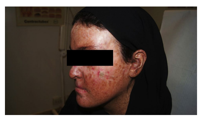
Figure 1 Freckle-like brown macules and erythematous, indurated plaques with adherent scales.

freckle-like brown macules on her face, neck, and upper chest (Figure 2). Moreover, she had both reticulated hyperand hypopigmented macules over upper and lower limbs, especially over the dorsa of her hands and feet (Figure 3). Two scars were noted consisting of a surgical scar over the base of the neck and a trauma scar over her left cheek. Scalp examination revealed a 2×1 cm, hairless plaque and decreased hair density all over her scalp (Figure 4). No mucosal lesions, facial telangiectasia, or palmer pits were noted. Joint swelling and tenderness were not appreciated.