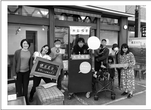
Figure 1. Health café “Oishi Café” in the Takajo area of Shizuoka.

hundred twenty people were asked to participate in the study, and 16 agreed to participate. The author interviewed the visitors through casual conversation (unstructured interview method). After consent was obtained, the conversation was recorded by an IC recorder. A verbatim transcript was made from the recorded conversations.