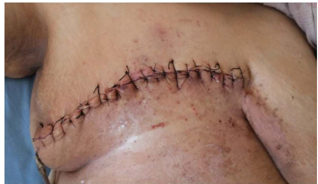
Figure 3 Four days postoperative view of a patient who underwent total mastectomy and axillary clearance by the tumescent technique.

by Worland 16 in 1996, when he observed its successful use in abdominoplasties, but it was reserved for elderly patients and those with poor anesthetic risk, especially those with ASA score III or IV. 5 Although epidural anesthesia, intercostal block, and paravertebral block are used in these situations, all are technically demanding, not free of complications, and still have a failure rate. 15 The