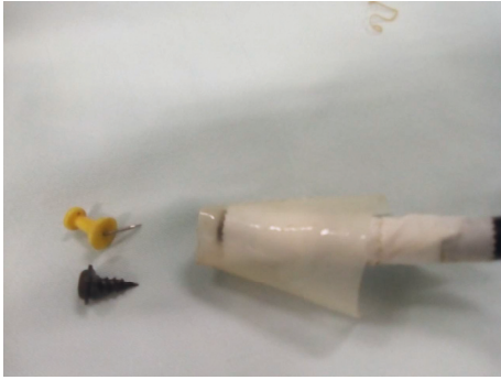
FIGURE 5: Elongated pin and thick screw safely extracted. Note the bended tip of the pin which was impacted in the antrum wall.