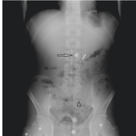
FIGURE 1: Abdominal X-ray: arrow showing 3 metallic objects (screw, coin, and plastic head pin) in the stomach, and arrow head showing another plastic head pin well into the small intestine. Note that the small metal scrap that was later seen on endoscopy is not evident here.