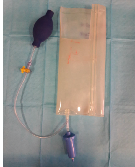
FIGURE 2: A plastic transfusion pressure infusor. Note the missing rubber part used to construct the hood.