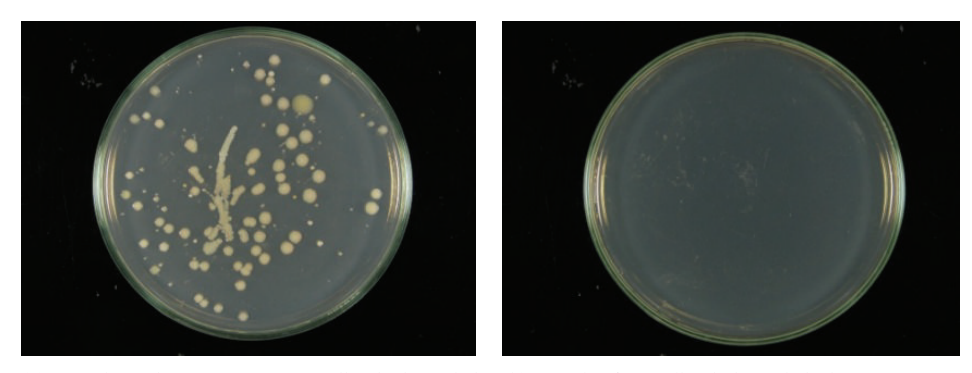
(a) Result without immersing milkers' discarded gloves in herbal soup

FIGURE 2: In vitro antibacterial activities of herbal soap produced with the most active extract of S. macranthera. Tests were performed in triplicate.