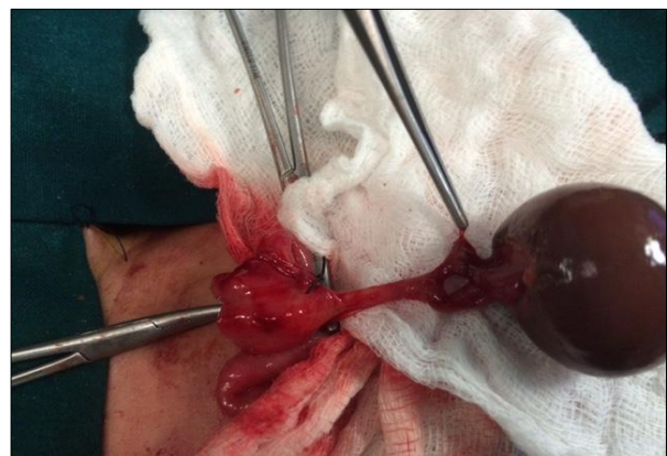
Figure 2: ovarian cyst torsion managed with open approach.

oophorectomy (Table 1). One other baby who had a large complex ovarian cyst also underwent oophorectomy. Four of these cases who had ipsilateral hypoplastic fallopian tube underwent salpingo-oophorectomy. Only one baby who had a simple serous cyst underwent cystectomy preserving normal ovarian tissue. Average hospital stay was 5-7 days. Post-operative period was uneventful.