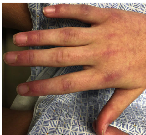
Fig 2. Notable periungual erythema, ragged cuticles, and livedo pattern on the dorsal hand with erythema overlying the metacarpophalangeal joints and swelling of the proximal interphalangeal joints.