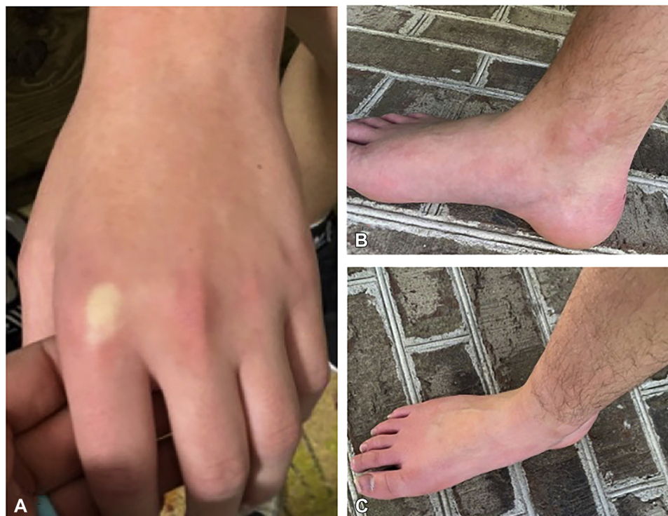
Fig 1. Blanching erythema overlying the dorsal surface of the hands and feet. Given the transient nature of EM, we did not have an opportunity to observe the changes. Clinical images courtesy of family, representative of the patient's less progressive erythromelalgia episodes.