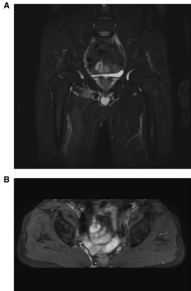
Fig. 3. Updated MRI without evidence of cyst remanence.

Cystic lesions surrounding and connecting to the hip joint are often fluid-filled, herniated sacs derived from the joint space through a one-way valve mechanism. They can be histologically classified as synovial or ganglion cysts. Ganglion cysts are contained within a capsule consisting of