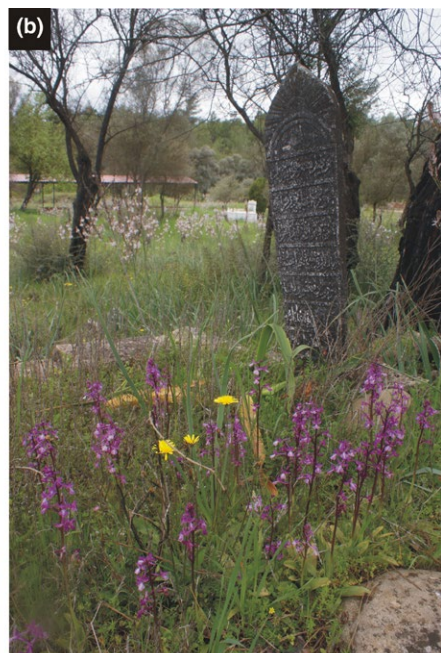
FIGURE 2 Mass occurrences of orchids in Turkish graveyards. (a) graveyard of Kızılağaç village (Muğla) with Orchis italica , (b) graveyard of Uğrar village (Antalya) with Orchis anatolica .