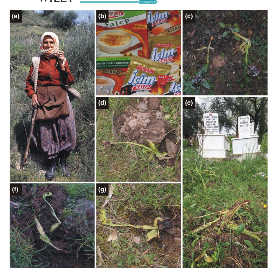
FIGURE 1 (a) Salep harvesting elderly woman near Söke (Aydın) in April 1993; (b) different instant salep products are widely available in Turkish stores; (c) excavated Anacamptis syriaca specimens in the graveyard of Belen village (Antalya Province); (d) excavated flowering Anacamptis papilionacea specimen in the graveyard of Bayır village (Muğla Province); (e) excavated fruiting Himantoglossum robertianum specimens in the gravevard of Kemer village (Muğla Province); (f) excavated juvenile H. robertianum individual and flowering Ophrys lutea subsp. minor specimen in the graveyard of Besikci village (Antalya Province); (g) excavated Ophrys blithopertha specimen in the graveyard of Bayır (Muğla Province)

at least 28,200 kg of salep was exported annually between 1994 and 1999 (Kasparek & Grimm, 1999). To gain 1 kg of dried salep, approximately 625–4,762 specimens (mean \pm SD = 2,599 \pm 1,710) are destructively harvested (Sezik, 2002b). The number of orchid individuals collected annually in Turkey is estimated at 10–20 million by Kasparek and Grimm (1999), 30 million by Özhatay (2002), and 40 million by Sezik (2002a) Sezik (2002b).