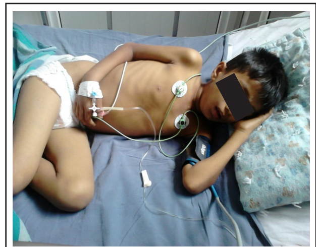
Figure 1. The child being monitored in the PICU.

persistent nausea and vomiting with attempted feeds. Moreover, yellowish discoloration of the body became highly pronounced and serology for viral etiology came positive for hepatitis A (i.e. HAV IgM antibody). At the time, lab report findings suggested conjugated hyperbilirubinemia (Table 2). Thus, the provisional diagnosis of acute viral hepatitis with cholestasis as an atypical manifestation was made. The child was then transferred to the Pediatric Intensive Care Unit (PICU) for close monitoring and to look for any signs of hepatic encephalopathy (Figure 1).