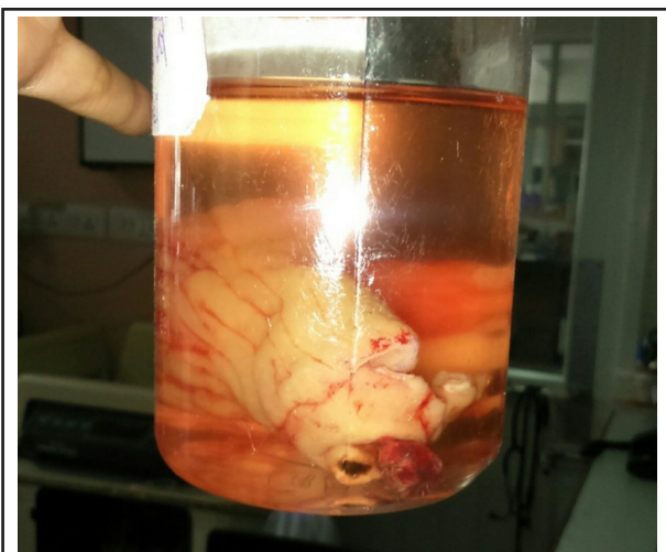
Figure 3. Specimen sent for histopathology.

The cut section showed an ulcer adjacent to the lumen of the diverticulum. Thus around 10 cm of ileum along with the diverticulum was removed and end to end anastomosis was done. The resected sample was sent for a histopathology examination (Figure 3).