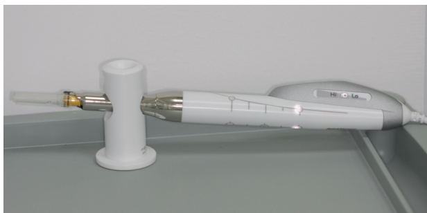
Fig. 1. Computer-controlled anesthetic system (Quicksleeper5®).

procedures, rather than in surgical therapies with long operating times. We report two cases of root planing under local anesthesia, using a CIAS, followed by literature review.