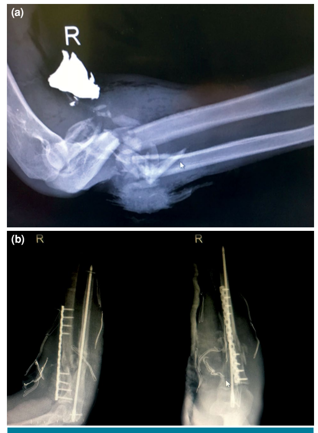
FIGURE 2. (a) Preoperative lateral elbow X-ray of a 41-yearold male patient who was admitted to emergency department due to a grenade injury. (b) Postoperative anteroposterior and lateral elbow X-rays of same patient who underwent open reduction and internal fixation of both bone forearm fractures.

The average age of patients in similar battles in recent years was around 26 years.<sup>[9-11]</sup> Similarly, the average age of patients in our study was 27 years.