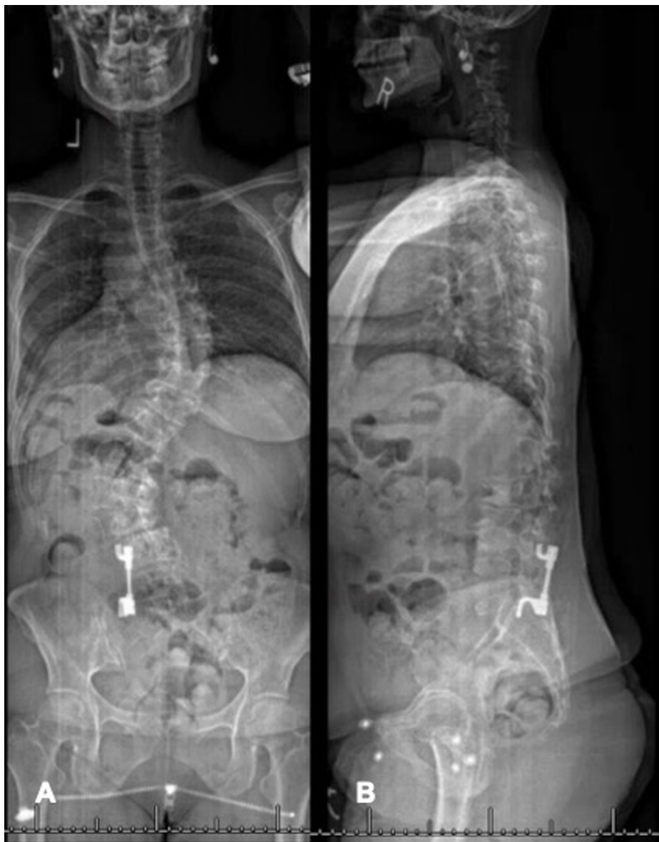
FIGURE 1: (A) AP and (B) lateral scoliosis X-ray of unilateral L4-sacrum instrumentation for treatment of adolescent idiopathic scoliosis.