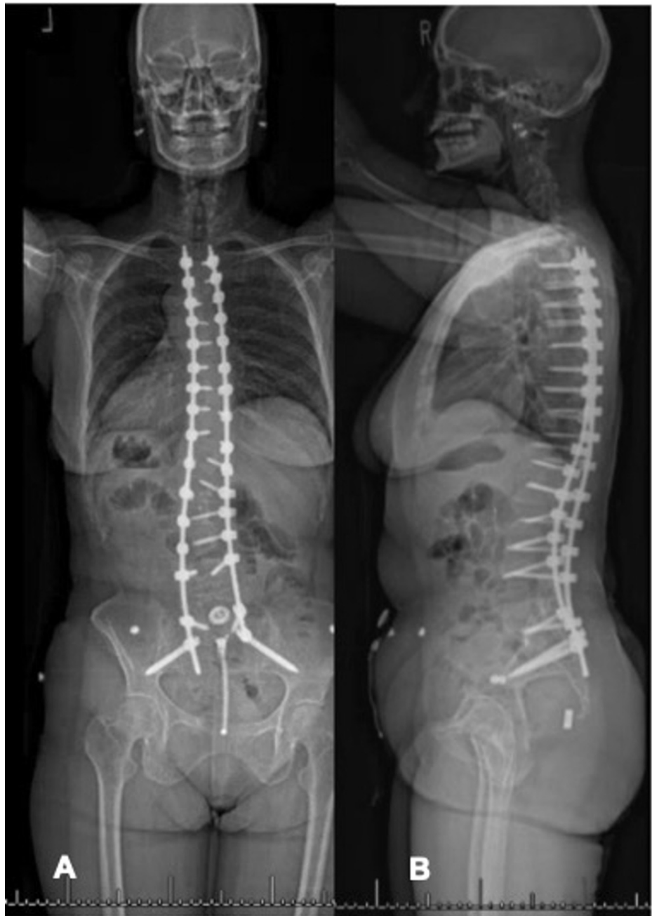
FIGURE 3: (A) AP and (B) lateral scoliosis X-ray status post T3-pelvis instrumentation and fusion. Post-operative sagittal parameters: thoracic kyphosis: 25°, lumbar lordosis: 31°, T1 pelvic angle (T1PA): 16°, pelvic incidence (PI): 50°, sagittal vertical axis: 0 cm, PI - lumbar lordosis (PI-LL) = 19°.