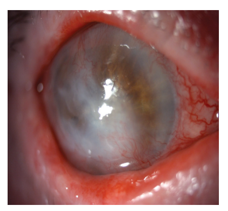
Figure 2. Complete resolution of keratitis with residual corneal scarring