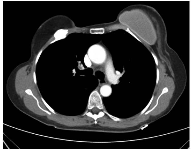
Fig. 2. Computed tomography demonstrating a bone-forming lesion at the anterior end of the third rib.