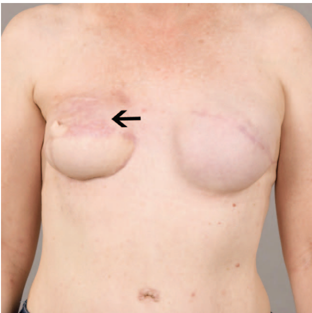
Fig. 1. The patient at a routine follow-up; the arrow marks the location of the right chest wall mass.

The removed mass measured 38 \times 14 \times 14 mm. Microscopically, the lesion represented a well-circumscribed, lobulated deposit of calcific debris with a granular consistency consistent with hydroxyapatite (Fig. 3). There was no evidence of gout, pseudogout, or amyloid deposits. The lesion was centered in the soft tissue plane and involved skeletal muscle and nonspecialized fibrous connective tissue, including the periosteum and appeared to extend into the underlying rib by an erosive process rather than being osteocentric (Fig. 4).