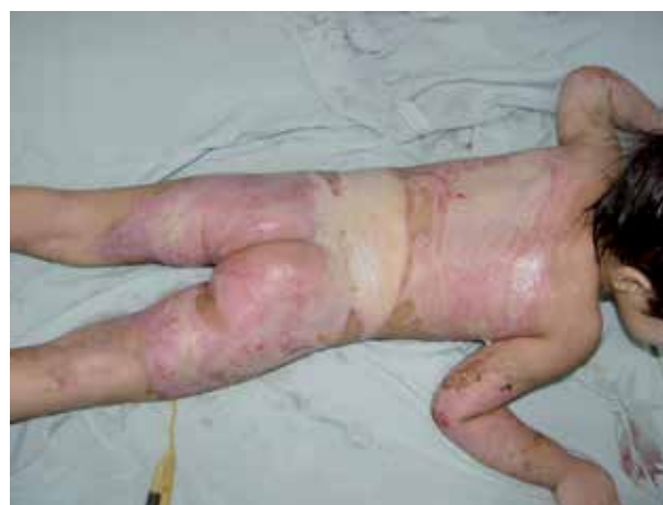
Figure 5. Burn Injury in a Child