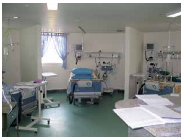
Figure 3. A Room With Several Beds, Velayat Burn Care Center, Rasht, Iran