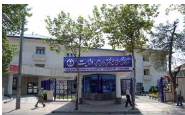
Figure 2. Velayat Burn Care Center, Rasht, Iran