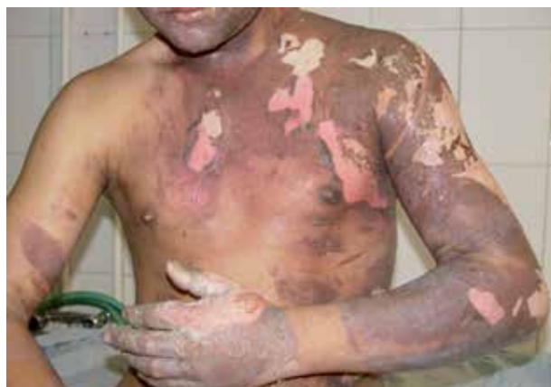
Figure 4. Burn Injury in an Adult Patient

Mortality was also statistically significant with regard to the level of education ( P = 0.0001 ). The mortality rate was 5.6% in patients with academic education; while this rate reached to 19.5% in the illiterate. Moreover, unemployed were more prone to burn injuries as 62.4% of patients were unemployed. The mortality rate was higher in the unemployed patients; 12.4% in unemployed compared to 6.9% in employed patients ( P = 0.0001 ). In the current study, populations with lower socioeconomic status were at higher risk of burn injuries. In this regard, 88.7% of burn patients were from low-to-moderate income families. The mortality rate was 0% in high and 10% in lower socioeconomic classes. This observation showed a borderline association ( P = 0.066 ). Mortality was also statistically significant with marital status ( P = 0.021 ); it was 11.5% in married patients compared to 8% in single patients. Additionally, there was a significant relation between various causes of burns and rate of mortality; for instance boiling water burn compared to other burn causes ( P = 0.0001 ).