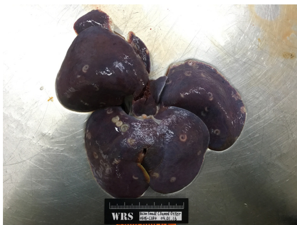
Fig. 3. Gross findings of the visceral pentastomiasis. The parasites were scattered across the liver's surface.

the lymphatic duct. A 0.5 \times 0.5 \times 0.5 cm cyst was found in a superior deep cervical lymph node. Besides the tumor, seven spiral-shaped parasites were found on the lung surface, and some others were noted embedded in the adipose tissue at the hila. The same parasites were also noted spread haphazardly on the surface of visceral organs in the abdomen and on the mesentery and omentum (Fig. 2). There was a large number of these parasites. A small number of them had migrated into the liver, lungs, and pancreas parenchyma (Fig. 3); these parasites had hard chitinized cuticles. There were also abundant uroliths in both kidneys.